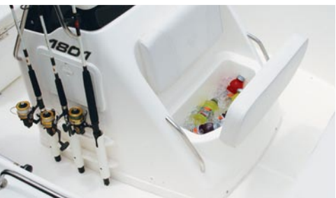
The console features a 25-quart insulated cooler and flip seat combo.