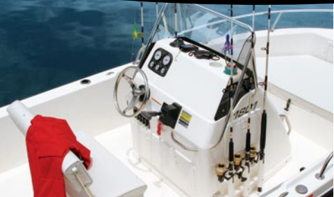
Practical helm layout allows for comfort, control and, of course, fishing.