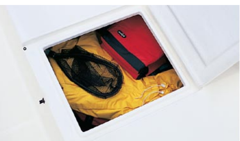
180-quart compartment built-in for storing everything you want to keep dry.