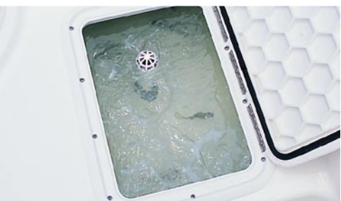
Keep your bait lively and fresh in the aerated, 12-gallon transom baitwell.