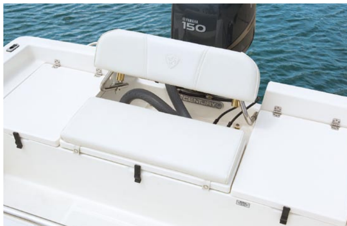
Rear seating with tilt-up cushion and rod holders.