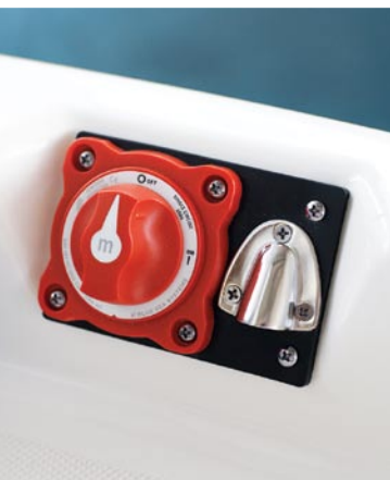
Trolling motor power center located at bow.