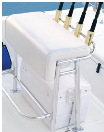
Optional deluxe leaning post with 70-quart cooler and rod holders.