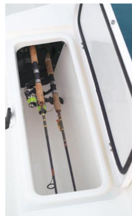
Store rods safely and securely.