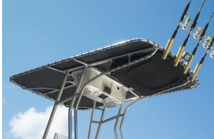
Optional T-Top with E-Box including MP3 compatible stereo and additional storage.