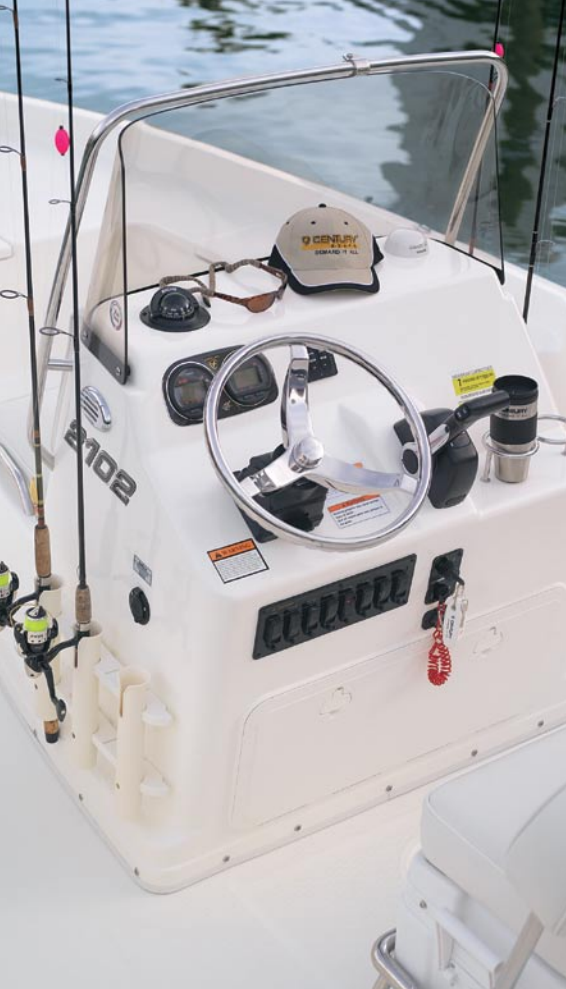
Take control behind a low-profile, feature-packed helm.